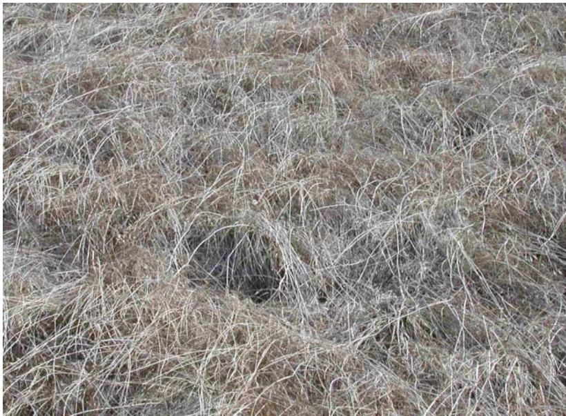
Typical summer signature of a mature Danthonia grassland with prostrate flowering culms laying on the ground.

The remnant coastal terrace prairie plant community of the Richmond Field Station totals approximately 6½ acres within an overall 14 acre openspace stretching from the original shoreline to approximately a quarter of a mile inland. The soil is a poorly drained clay of the Clear Lake Series that often forms a perched water table in the winter rainy season (SCS 1977). The grassland is a level terrace or alluvium deposit approximately 10 feet above mean high tide. California oatgrass ( Danthonia californica ) is the dominant cover in the coastal terrace grassland. In the spring and summer months the signature of California oatgrass are the prostrate arching flowering culms laying on the ground. Even if the few seeds of the small panicle fail to pollinate or ripen, these culms are full of good seed hidden behind each of the swollen leaf sheaths.