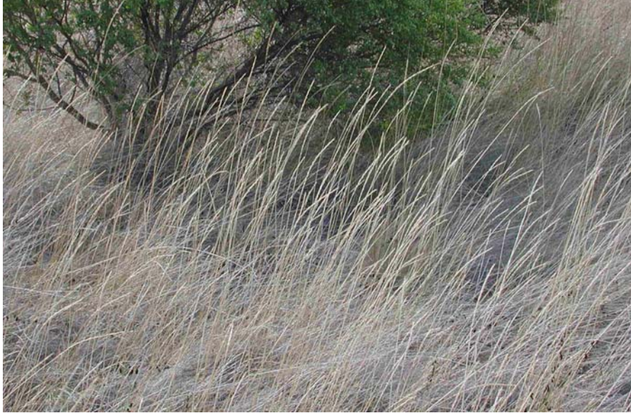
Dense stand of slender wheatgrass on the UC Richmond Field Station.

The presence of the slender wheatgrass at this site is a significant botanical discovery. Lowland ecotypes of slender wheatgrass are very rare. In the greater Bay Area, slender wheatgrass is found in the Berkeley-Oakland Hills on clayey serpentinite soils. At the field station, rather than appearing as an assemblage of bunchgrasses like blue wildrye ( Elymus glaucus ), slender wheatgrass creep out from the base, developing a pure stand of upright flowing culms.